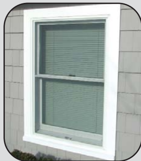
5/4 x 4 w/J