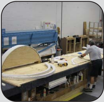
Our Nashua, NH Millwork Shop

Using our stock PVC Boards, Sheets, and Mouldings, we fabricate Window & Door surrounds to order. We also bend boards into specified radius shapes. We operate our own millwork shop in our Nashua, NH Warehouse, giving us the flexibility to respond to your project needs.