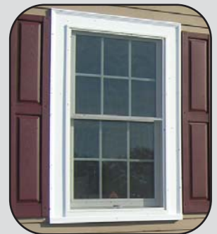
Window Surround w/Backband