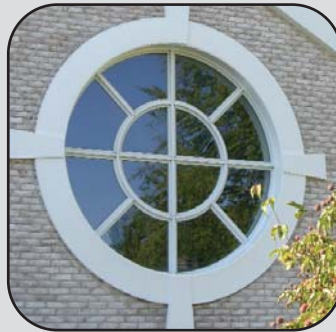
Optional Keystones Available