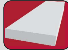
5/4" x 6" Item #519275606