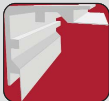
5-1/2" Smooth Corner w/J Channel 5/4" x 6" x 20' Item # 519275761

Custom Corners are available, inquire at your local branch.