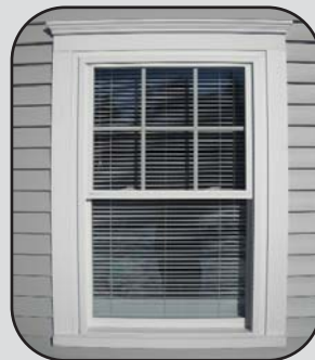
Window Surround w/Mantel