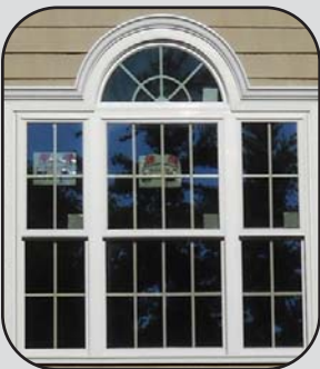
Vicon Crown Moulding