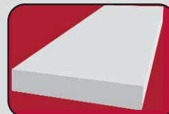
5/4" x 10" Item #519275610