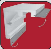
5-1/2" Smooth Corner w/Nail Fin 5/4" x 6" x 20' Item #519275768