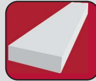
5/4" x 4" Item #519275604