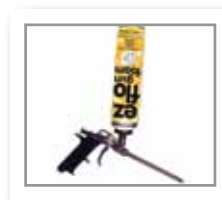
Pur Shooter Gun with foam can attached