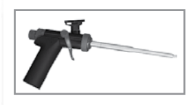
Pageris Eco Gun — top of the line