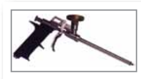
Pur Shooter Gun (left) — excellent starter gun

EZ FLO Foam 27 oz can Item #507006600 EZ FLOR Pur Shooter Gun Item #507006610 Pageris Eco Gun Item #507006615