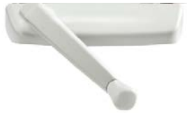
Casement Handle (standard white)